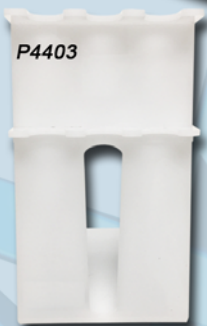
3-Place Rack up to one multi-channel