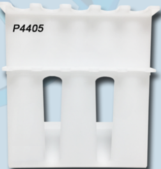
5-Place Rack up to two multi-channels